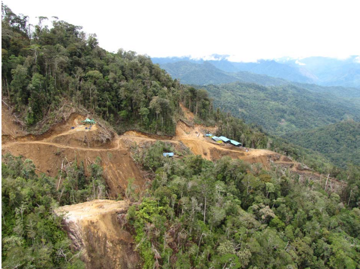
New top camp with NEV 18 (left centre) and drill pad for NEV 19 (left front)